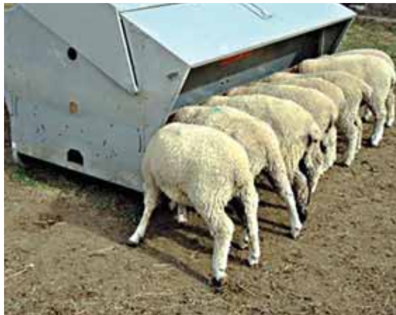
Added feeding expenses and income